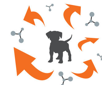
Unregulated movement of dogs spreads rabies

Every year, millions of dogs are captured and stolen to be transported throughout Indonesia to supply the demand for dog meat. Many are stolen family pets and illegally trafficked dogs collected from the streets and rural communities.